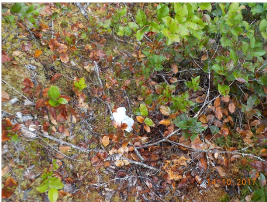
Typical toilet paper litter