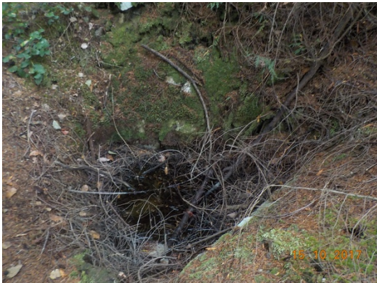
Hazard hole #2