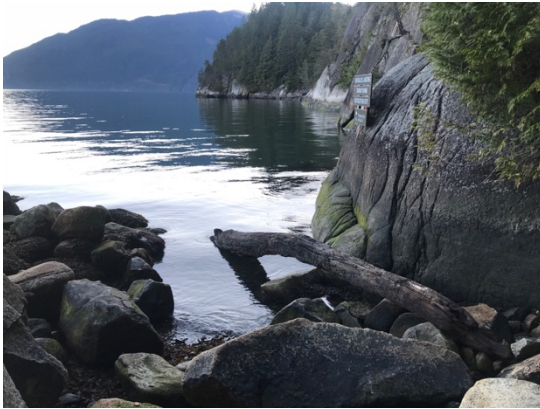
Drift log in boat run