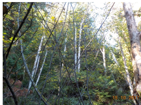
Hazard tree #3