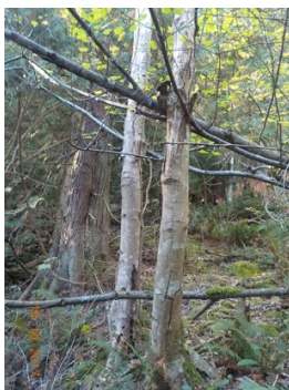
Hazard tree #2