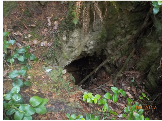
Hazard hole #1