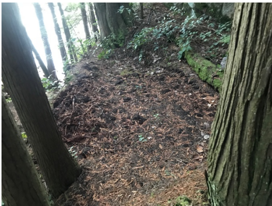
Tent pad levelled by users