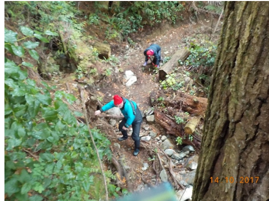
Improving creek crossing