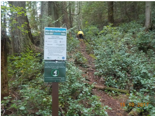
Trail drainage control