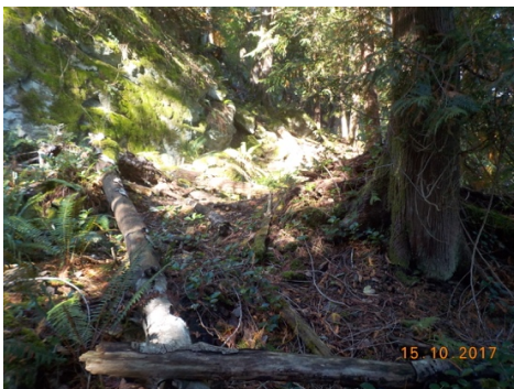
Trail steps needed