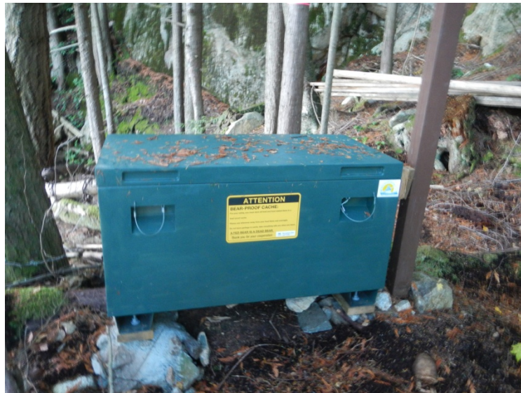
Typical food cache box