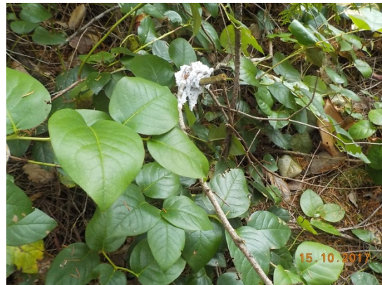
Typical toilet paper litter