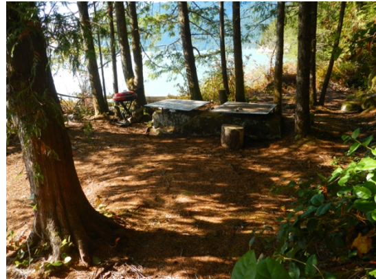
Tables and BBQ