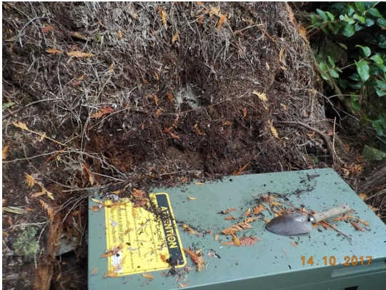
Hummock at food bin