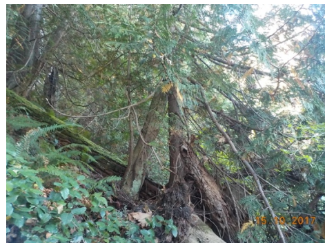
Hazard tree #1