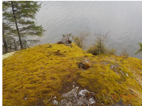
Moss & tree damage