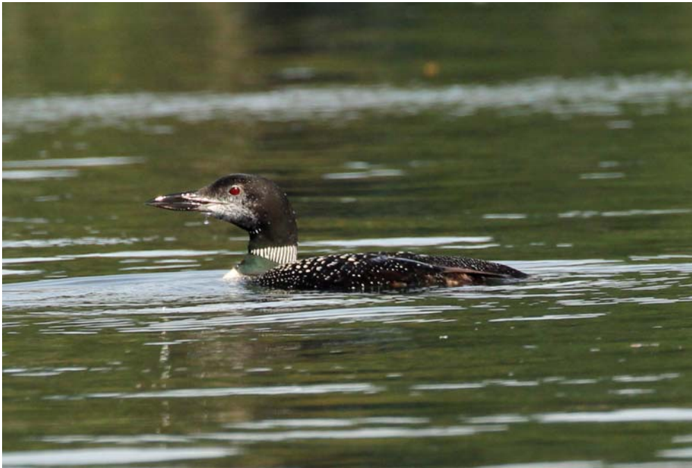
Loons and herons were busy fishing.